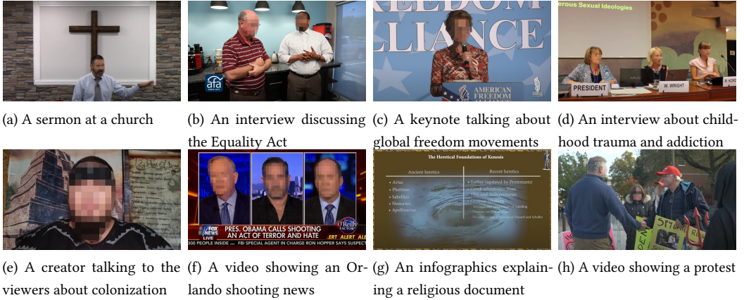
Fig. 2. Example videos of public speech (the top row), speak to the viewers (bottom left), news and information (bottom middle two), and public action (bottom right).